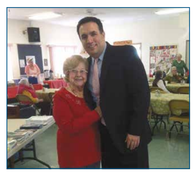
Ebensburg Senior Center