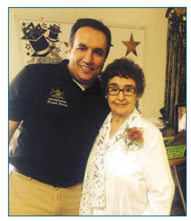
Portage Senior Center